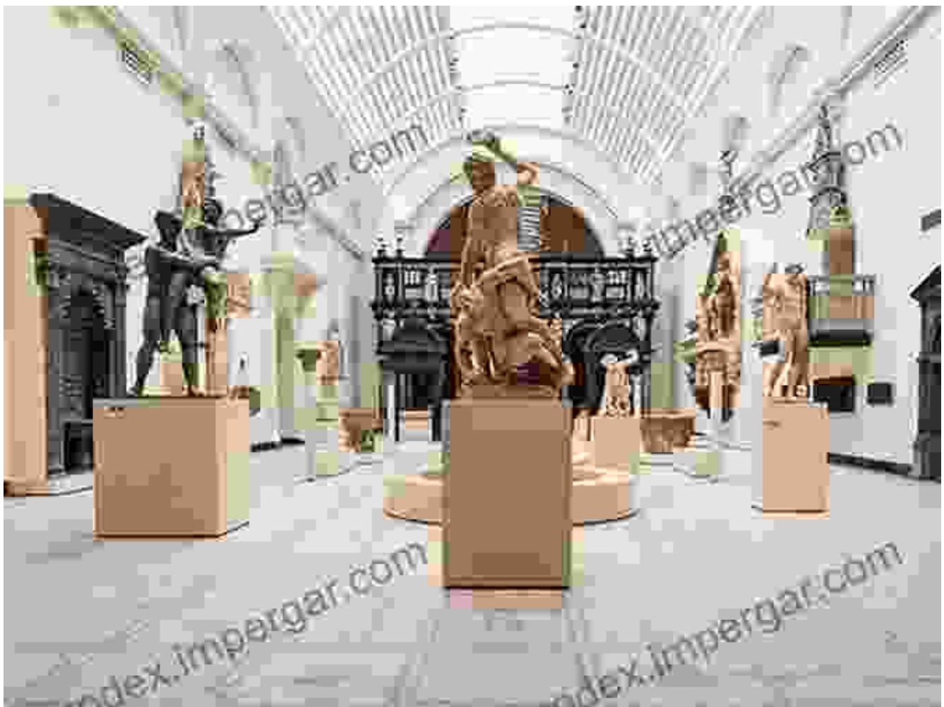
The grandeur of the Victoria and Albert Museum's interior, showcasing its architectural beauty.

Beyond its awe-inspiring collections, the V&A itself is an architectural masterpiece. Designed by Sir Aston Webb in the opulent Victorian style, the museum's grand facade and soaring interiors create a breathtaking backdrop for its artistic treasures. Admire the intricately carved stonework, stained-glass windows, and opulent staircases that adorn the building.