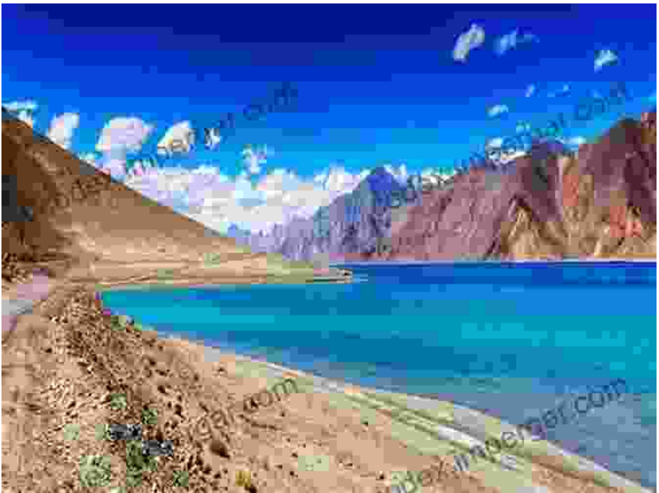
Pangong Lake, a breathtaking natural wonder

The lake is a popular destination for photographers and nature enthusiasts, who come to capture its breathtaking beauty. The best time to visit Pangong Lake is during sunrise or sunset, when the colors of the sky and water create a magical spectacle.