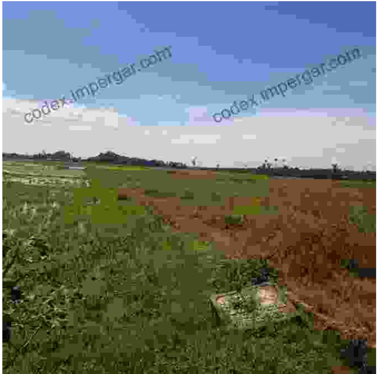
A Call to Conservation