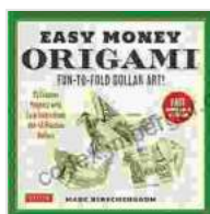
Image: [Alt text: Colorful and intricate origami animal designs created with paper money]